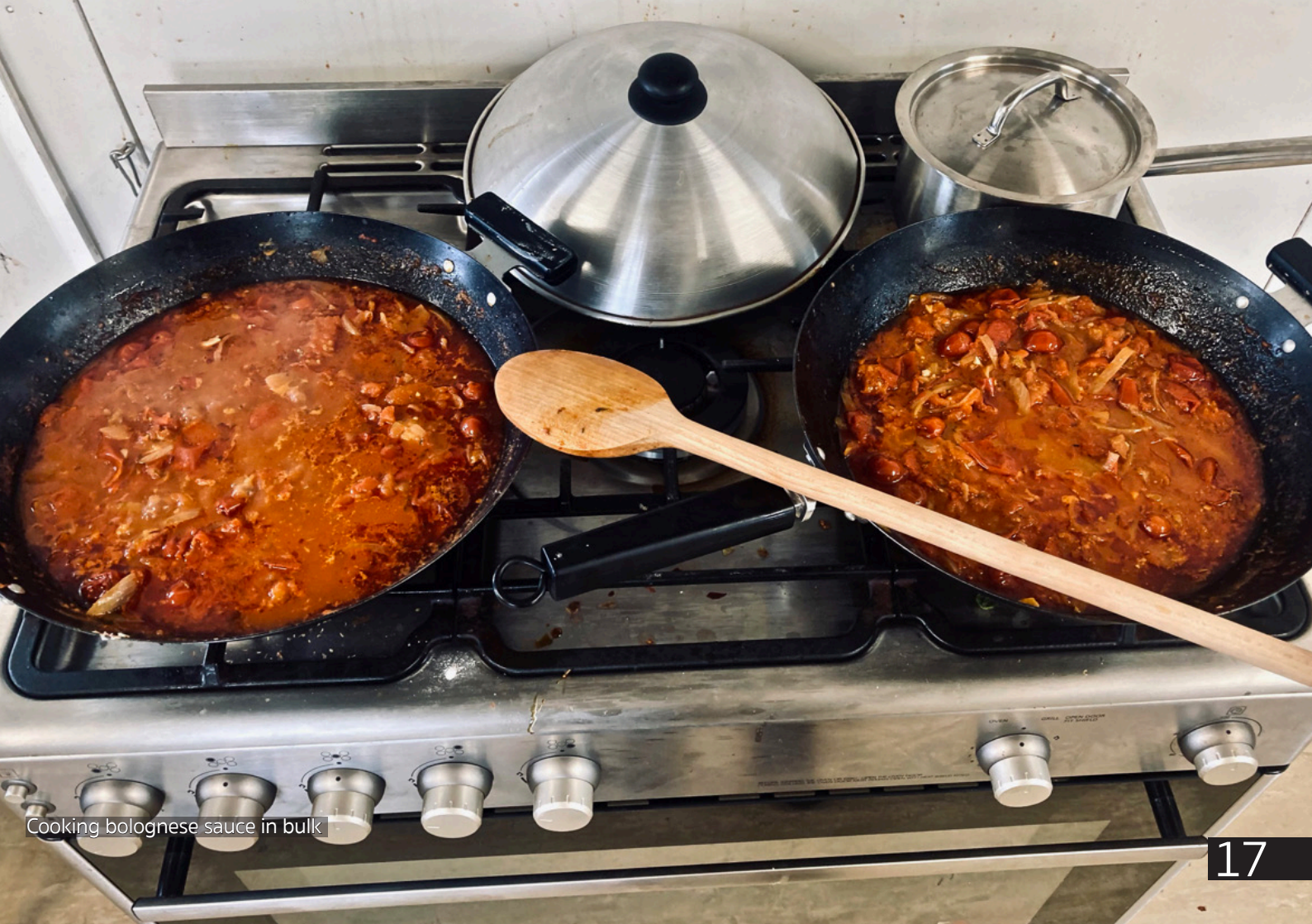
Cooking bolognese sauce in bulk