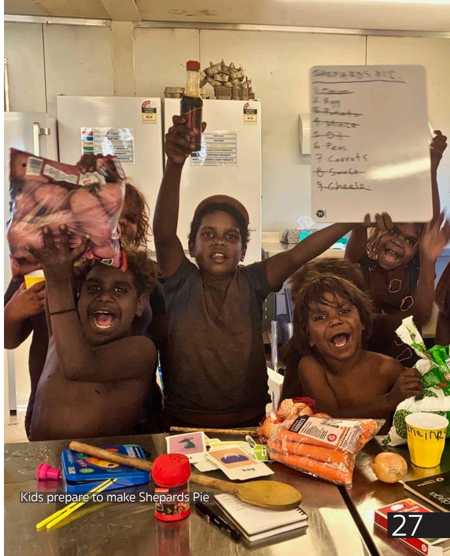
Kids prepare to make Shepards Pie