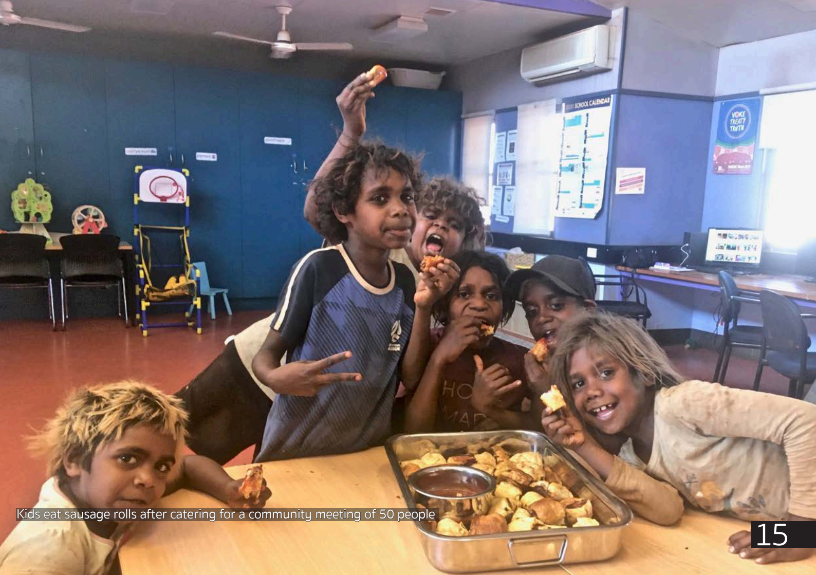
Kids eat sausage rolls after catering for a community meeting of 50 people