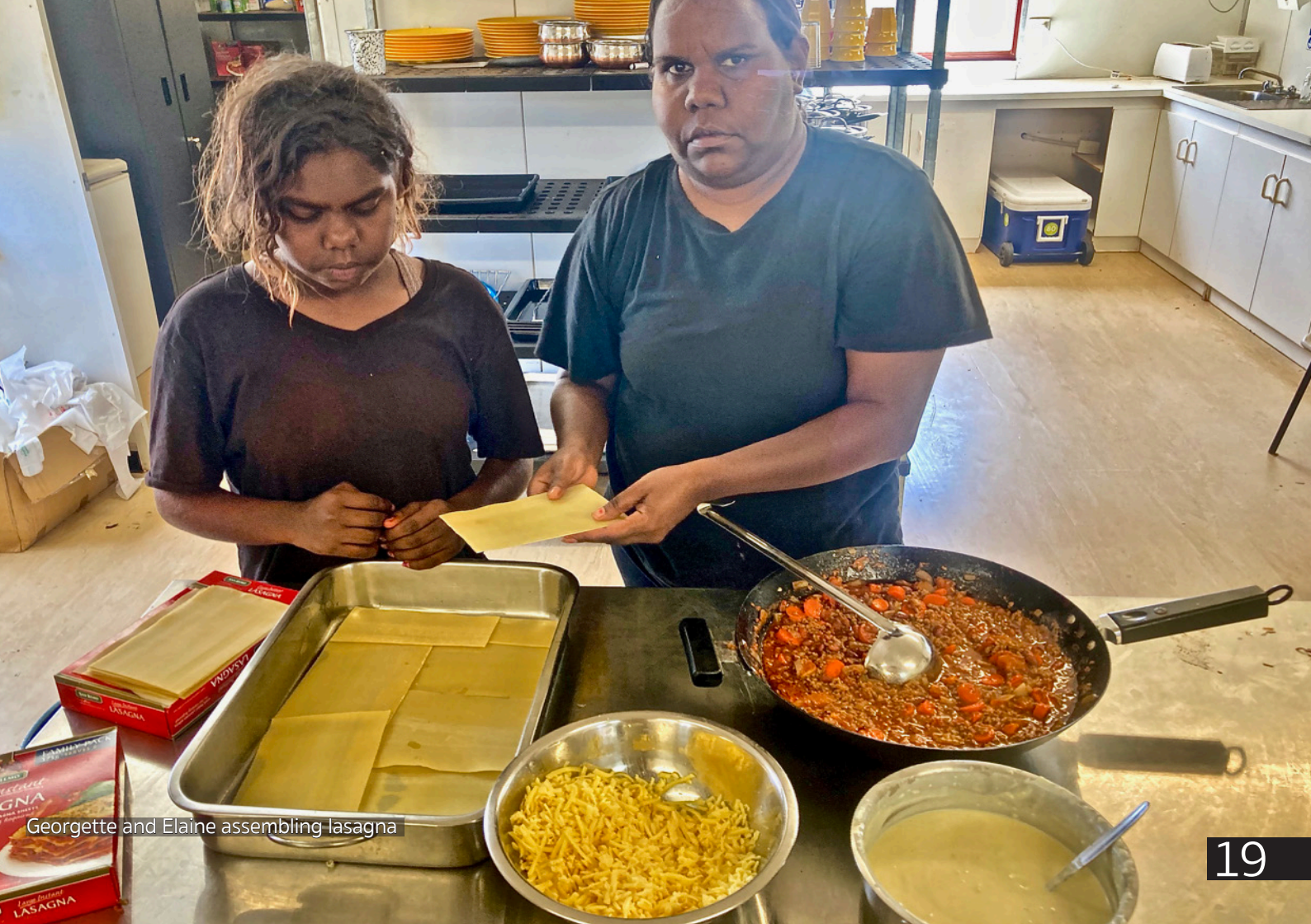
Georgette and Elaine assembling lasagna